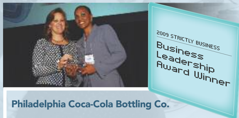
Philadelphia Coca-Cola Bottling Co.