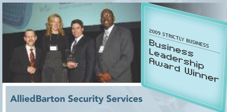
AlliedBarton Security Services

The JEVS Business Leadership Award honors companies that have developed relationships with JEVS to facilitate hiring and retention of individuals from its various skills training and career management programs. Companies that share JEVS' commitment to employee success on the job are selected in this category.